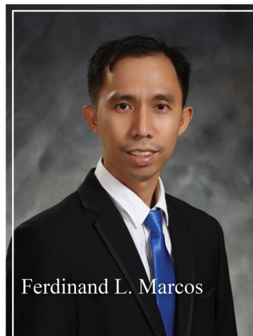
Ferdinand L. Marcos