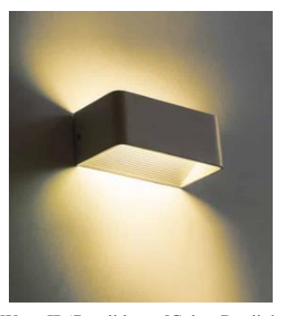
5 Watts IP67 wall lamp [Color: Daylight]