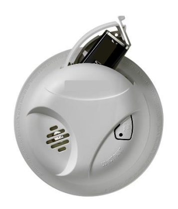
9V DC Battery Operated Smoke Detector with alarm