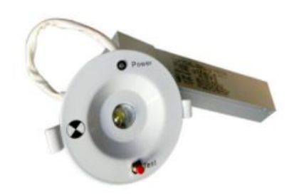
3 Watts Recessed LED emergency light [Ceiling Mounted]