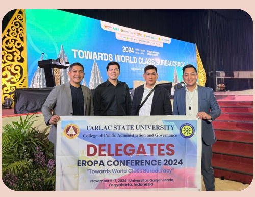
DPA student receives recognition in international joint research conference