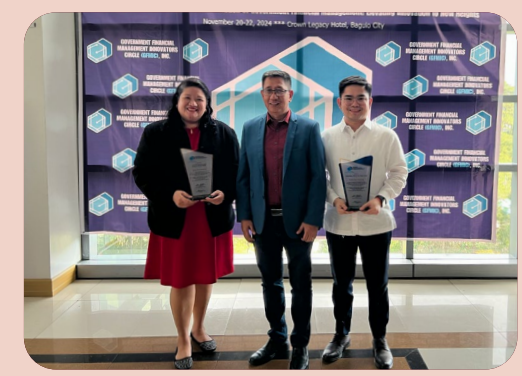
Finance team again brings home accolades to TSU